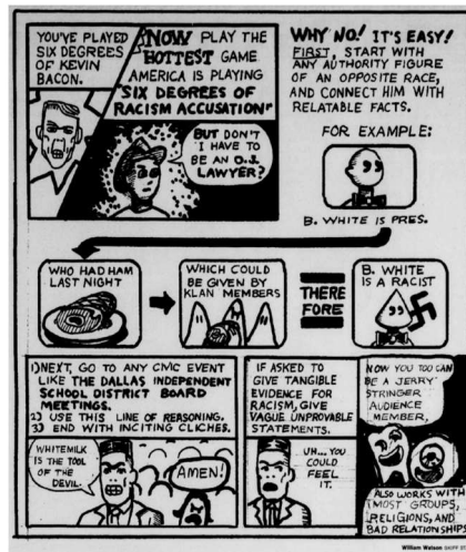
Figure 3. “Six Degrees of Racism Accusation” as featured in TCU DAILY SKIFF

49. In 1997, history yet again repeated itself. That year the Skiff revived TCU’s legacy of racist cartoon imagery when it mocked racial minorities and their complaints about racism: 92