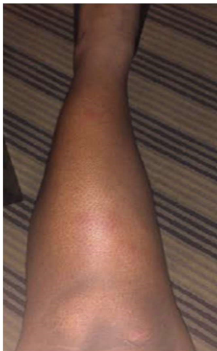
Figure 12. Left tibia covered in bug bites.