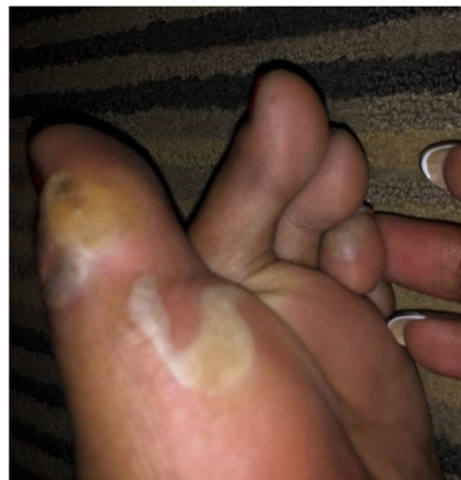
Figure 11. Left plantar blistered and swollen.