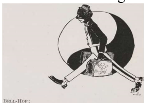
BELL-HOP: Whew! You Juniors must have a lot o' glad rags! Figure 1. Negro bellhop as featured in The Horned Frog 118 (1920).