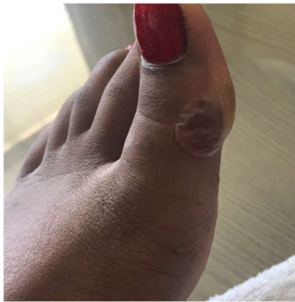
Figure 4. Left hallux blistered and swollen.