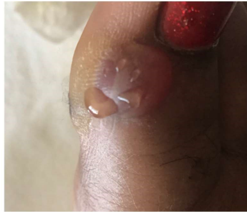
Figure 5. Right hallux blistered, swollen and oozing puss.