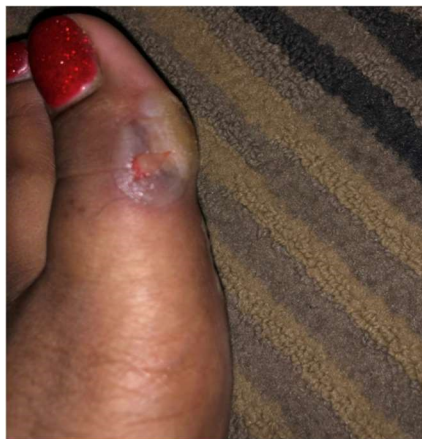
Figure 10. Left hallux blister/sore ruptured.