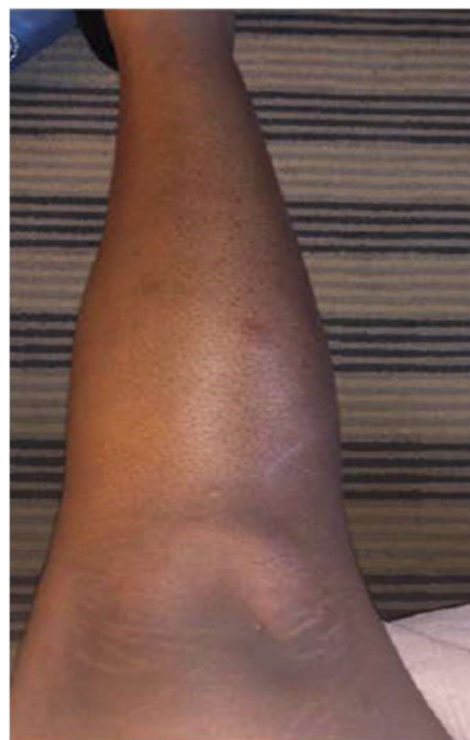
Figure 13. Right tibia covered in bug bites.