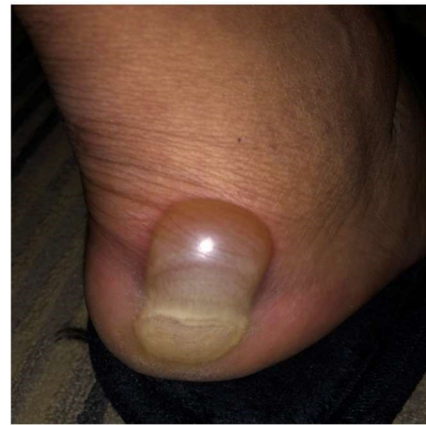
Figure 9. Right calcaneus blistered, swollen and full of puss and blood.