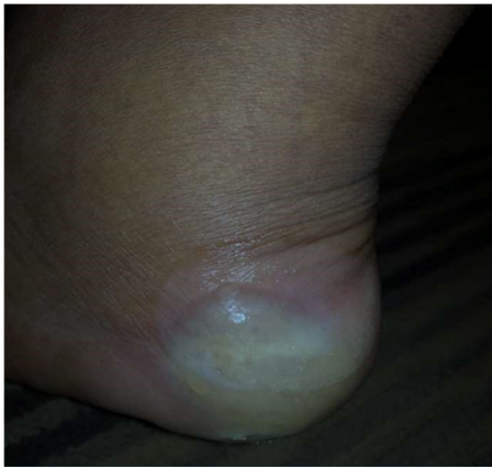
Figure 8. Left calcaneus blistered, swollen and full of puss and blood.